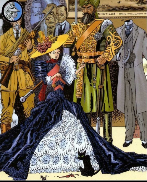
★ The League