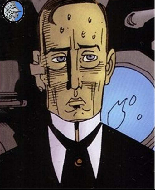
C1 Dr. Henry Jekyll