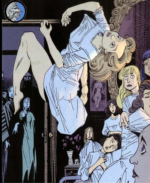
x2 Griffin's Rape